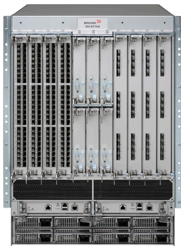
Figure 2: The VDX 8770-8 Switch supports up to 384 10 GbE ports, 216 40 GbE ports, and 48 100 GbE ports.