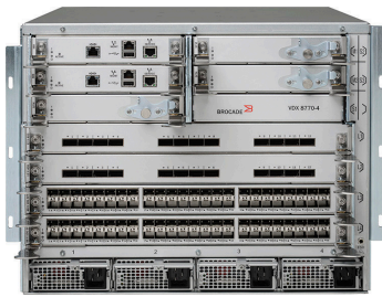
Figure 1: The VDX 8770-4 Switch supports up to 192 10 GbE ports, 108 40 GbE ports, and 24 100 GbE ports.